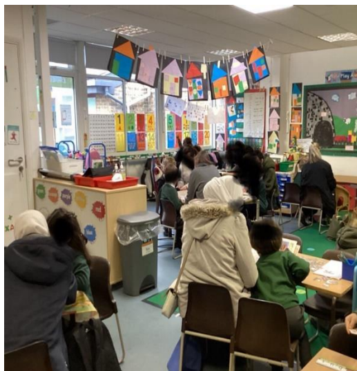
Friday morning reading sessions.

We are currently working in a Levelling-up area. we organised a visit from the Mobile Library with the school site in which we are situated on to visit us during one of our Stay, Play and Learn session. Working in partnership we were able to sign 11 families up to the library and families were able to borrow books all free of charge. The families are now aware of the local library services and what it has to offer. Parents are informed of the importance of early reading with their children. The children and the adults thoroughly enjoyed the experience. - Little Lion Family Hub.