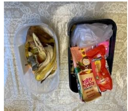
Containers for waste on table to separate out the food waste and promote recycling.

The Wilson Marriage Nursery-Little Learners