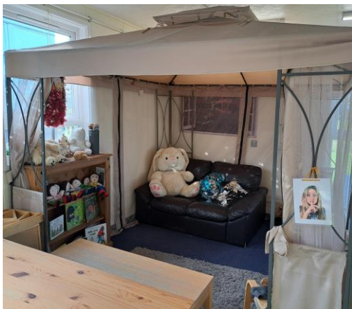
Calm and relaxing space to share stories.

We recently re-vamp our book areas making them cosier and inviting for the children and a place they can often seen sitting together on the sofa sharing a book with another child or adult. The children have learnt very quickly that the book areas are a place where they can sit quietly, relax, and begin to tell their own stories. Children are developing their language and communication skills when chatting and narrating together.